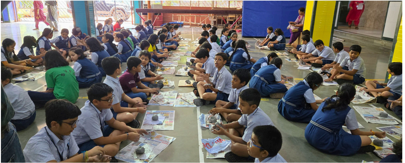
Training and awareness workshop on Eco friendly Ganesha Idols was held with 359 participants at Sadhu Vaswani School, Sanpada in coordination with Rotaract Club of Smart City & Interact Club of Sadhu Vaswani School.